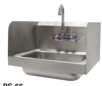
7-PS-66 7-PS-66-NF (Faucet Not Included)