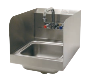
SPACE SAVER 7-PS-56 9" x 9" x 5" Bowl