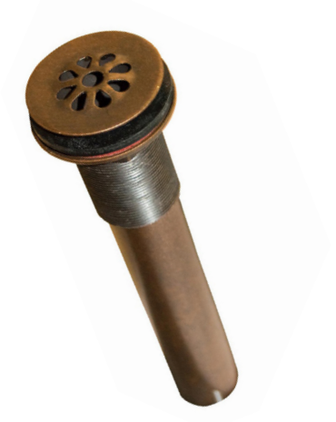
Shown in Weathered Copper

DR150-BN Brushed Nickel DR150-CH Chrome DR150-ORB Oil Rubbed Bronze DR150-PN Polished Nickel DR150-WC Weathered Copper DR150-MB Matte Black